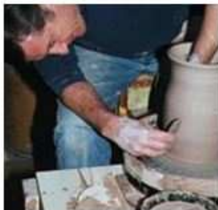
Shaping the clay

Once fully formed, the pot is cut off the wheel head with a wire and removed. The process is then repeated with the next ball of clay.