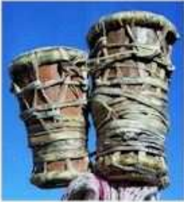
Omele batá drums from Nigeria