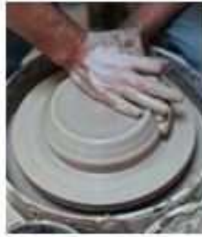
Centering the clay on the kick wheel

Clay can be made into vessels because of its unique physical properties. The molecular structure of clay means it has a 'plastic' quality, allowing it to be shaped into an infinite variety of forms. Subject these forms to sufficient heat and they are altered into a rock-hard material, making them both functional and durable. Clay is composed of the most common elements found in the Earth's crust and, as a result, is found throughout the world, beneath our feet. Clay was put to use by nearly every culture, often with extraordinary results. Pots can be made with bare hands using clay lubricated with water.