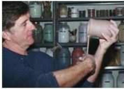
Pulling a handle for a mug

Once pots are bone dry, they can be bisque-fired in a kiln. This produces a hard yet porous vessel.