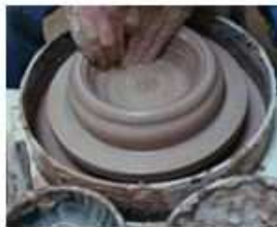
Opening up the clay

The potter, bearing down on the clay with their hands, then centres the clay. The fingers are used to first form the floor of the pot and then, to pull the walls of the clay up, typically into a cylindrical shape. Then the potter gently shapes the pot into the desired form, using the fingertips, as the wheel continues to spin.